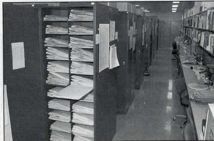
Figure 5. General view of the W. P. Fraser Herbarium (SASK) collection, which contains nearly 180,000 specimens.

SASK's ongoing efforts include the development of an electronic database based on information of the ca. 180,000 collection specimens, which are the foundation for nomenclature and are permanent records of our natural heritage serving as a testimony of the existence of the Saskatchewan plant species in the wild. This database will contribute valuable datasets relevant to taxonomy, biodiversity, conservation, and environmental biology. Specifically, it will provide concise systematic information documenting the province's past and present plant diversity, which, in conjunction with present and future botanical