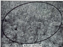
Figure 2. Habitat and population of Allium cernuum (circled) in southwestern Saskatchewan. Note the flower buds in the specimens. Photo taken in July 2009.

indicating species at risk, because of its declining numbers with subsequent special concern. 4