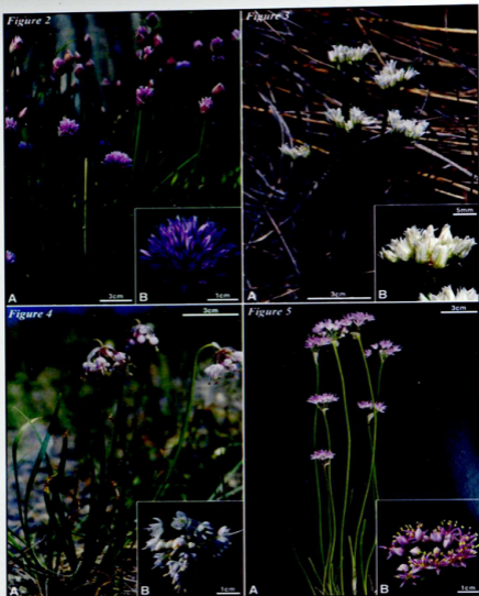
Figures 2–5. Allium species in Saskatchewan. 2. A. schoenoprasum ; 3. A. textile ; 4. A. cernuum ; 5. A. stellatum . A) Plant habit; B) Inflorescence. See article by Choi et al. on p. 146.

Front cover: Black-footed ferret ( Mustela nigripes ) in a black-tailed prairie dog ( Cynomys ludovicianus ) colony in Grasslands National Park, Saskatchewan. For more on the reintroduction of black-footed ferrets to Canada, see article by Wruth et al. on p. 133. Patrick McManus